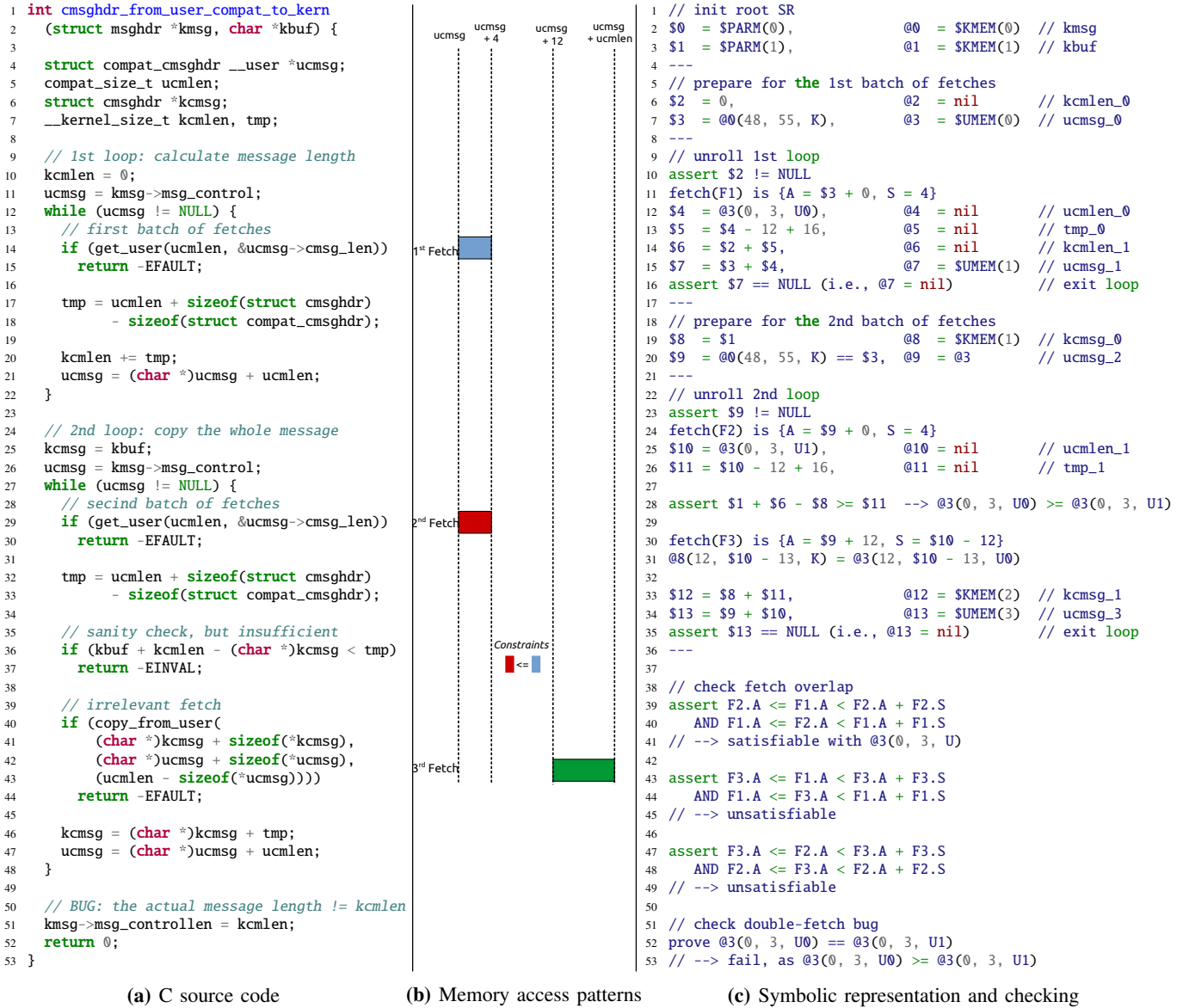
Fig. 7: A double-fetch bug in cmsghdr_from_user_compat_to_kern , with illustration on how it fits the formal definition of double-fetch bugs (7b) and DEADLINE’s symbolic engine can find it (7c).

This example also shows that although developers tend to exercise precaution to prevent double-fetch bugs , for example, by placing the sanity checks at line 36 (7a), such checks might not be sufficient as shown in line 28 (7c).